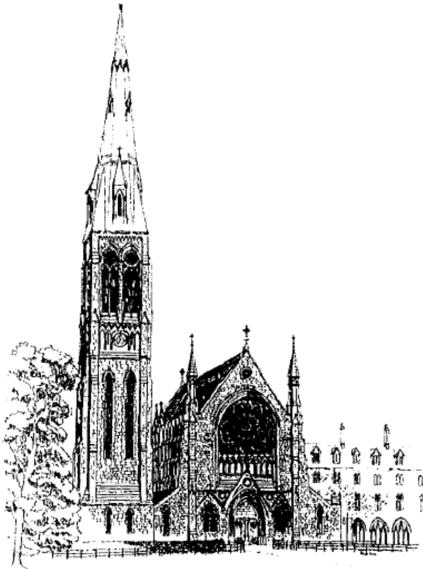
The College Chapel at Saint Patrick's College, Maynooth

Text of the Psalms: Copyright © 1963, The Grail (England).