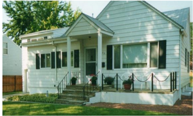
2420 Elm Street The Sisters' last residence in Billings, Sept 2011