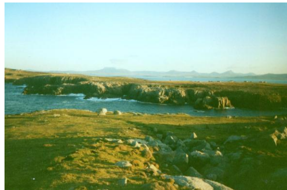
View of Tory Island