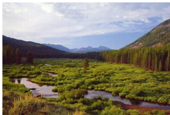
Scenic View of Montana

In 1971, the Sisters in Donegal town moved into their new home in Ardeskin.