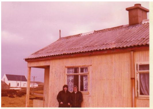
Sister's first residence on Tory Island