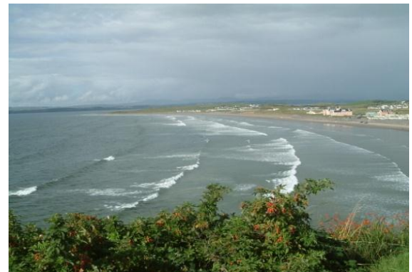
Rossnowlagh Beach, Donegal

The opening of a holiday house for Sisters, Sancta Maria, in Rossnowlagh in 1962.