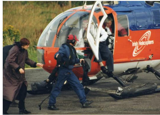
Arriving by helicopter!