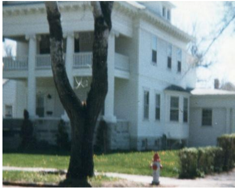
142 Wyoming Ave, Billings, Montana. The Sisters came here in 1966.