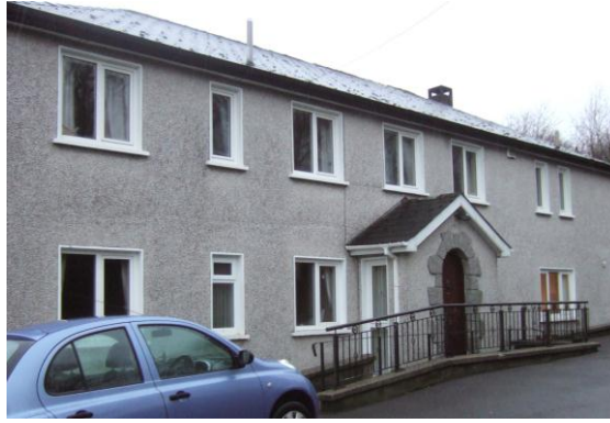
Convent at Windy Hall, Letterkenny