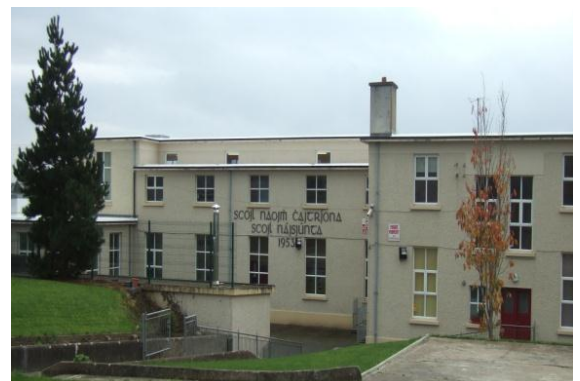
St. Catherine's National School, Ballyshannon

In 1953, St. Catherine's new primary school was opened in Ballyshannon replacing the school opened in 1900. This left the way open for extending into secondary education on that site.