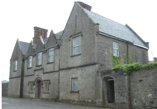
The old Workhouse

In 1890 the Sisters began nursing in the fever hospital attached to St. Brigid's Workhouse in the town. Ballyshannon Community Care facility is on that site today.