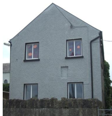
Carrickboy National School

Simultaneously with beginning the nursing foundations, Sisters began to expand their educational apostolate within and beyond Ballyshannon: Glenties (1890), Donegal Town (1895), replacement of original school in Ballyshannon (1900). In 1919 Sisters began teaching in Carrickboy National School, Ballyshannon.