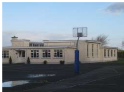
Convent Primary School, 2011

In 1875 three Sisters of Mercy left for Mercy ministry to Yass in Australia and worked in education and the parish.