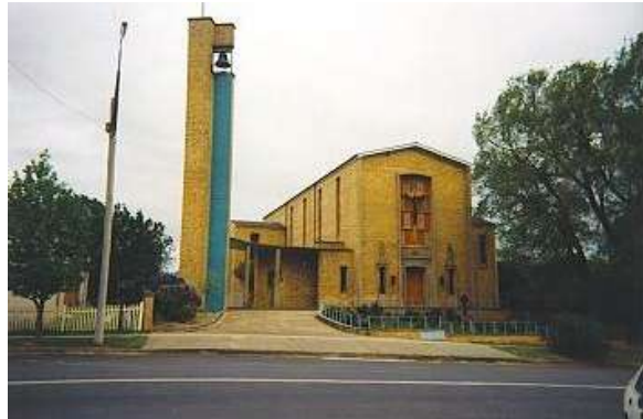
Parish Church, Yass