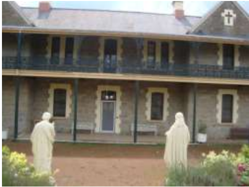
Yass Convent built by the Sisters of Mercy. It has been given to the parish as an extension of the School.

The Sisters still participate actively in parish ministry and work in partnership with St. Vincent de Paul Society locally in the parish. They also give invaluable support through their prayer.