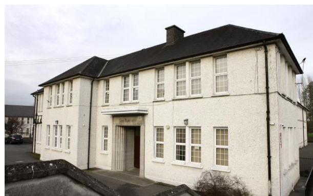
Scoil Mhuire, Tullamore