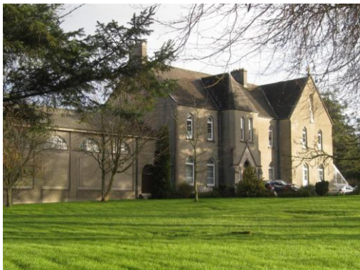
Convent of Mercy, Clara