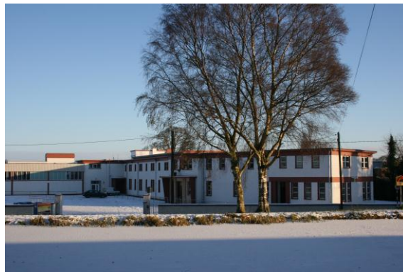
Sacred Heart School, Tullamore

http://www.ceist.ie/ceist_schools/view_school.cfm?loadref=139