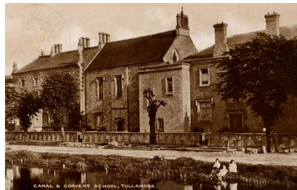
Canal & Convent School, Tullamore

The numbers of pupils in the primary schools increased and the community decided to build a Senior School (catering for 4 th to 6 th /7 th standards). They had acquired a site at the end of Harbour Street and in 1932 St. Philomena's School was opened.