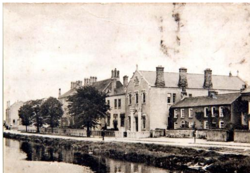
2 houses St. Joan's & St. Paul's; Sacred Heart School built 1910