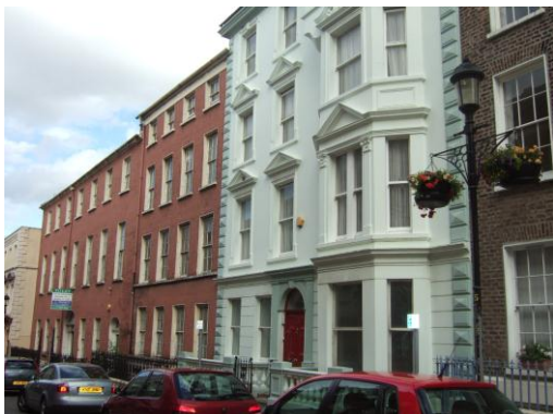
Convent of Mercy, Kells