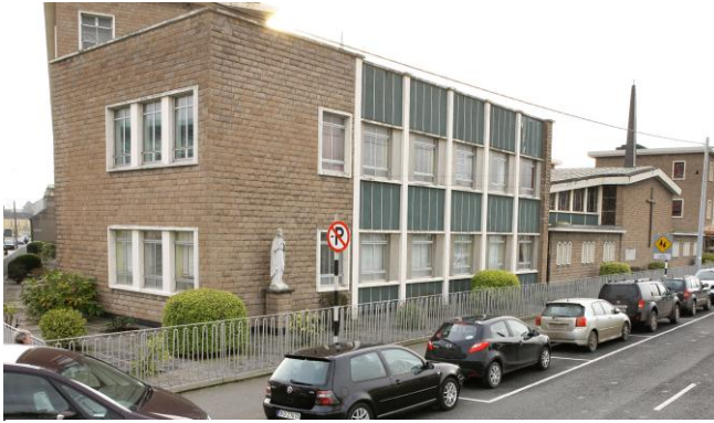
Novitiate block & Community Chapel, Tullamore

After consultation with Bishop Kyne, it was decided to go ahead with the building of a new convent rather than trying to renovate the old, which had grown too small for the number of Sisters living here. So, in 1960, two small houses owned by the Sisters on Convent Road, and the old secondary school were demolished and the first phase of the building started. This was a new Primary School – a three-storeyed building known as St. Joseph’s. The Sisters, staff