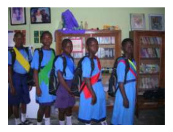
Eager pupils always ready to learn

'Misean Chara' has helped with computers and science equipment. When the pupils finish in Primary 6 they have the choice of going to the neighbouring secondary schools in the Diocese. All are very appreciative of what the school has done for their children over the years, not only in their academic success but in the care and concern that has been given in times of sickness, suffering and bereavement. Many of the past pupils who have gone to secondary schools have held the top places in their classes. Some have graduated and gone to University while others are back in the schools for Teacher Training experience.