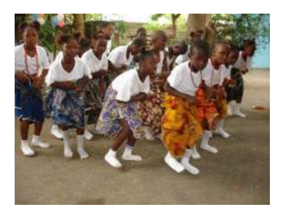
The pupils performing a culture dance

They are always so happy as they chat and greet the staff 'Good Morning'. Morning Assembly begins at 7.50a.m. with echoes of the pupils' choruses permeating the entire compound, the Nursery singing 'School is a happy place', while the Primary pupils, Christians and Muslims, are all singing 'Connected by Love' from the Alive O 3 Religious Education Programme. The staff gather together to pray God's Blessing on the day as pupils are gathering for Assembly.