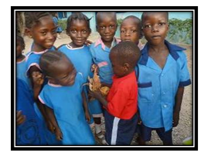
Children sharing together

They are always so happy as they chat and greet the staff 'Good Morning'. Morning Assembly begins at 7.50a.m. with echoes of the pupils' choruses permeating the entire compound, the Nursery singing 'School is a happy place', while the Primary pupils, Christians and Muslims, are all singing 'Connected by Love' from the Alive O 3 Religious Education Programme. The staff gather together to pray God's Blessing on the day as pupils are gathering for Assembly.