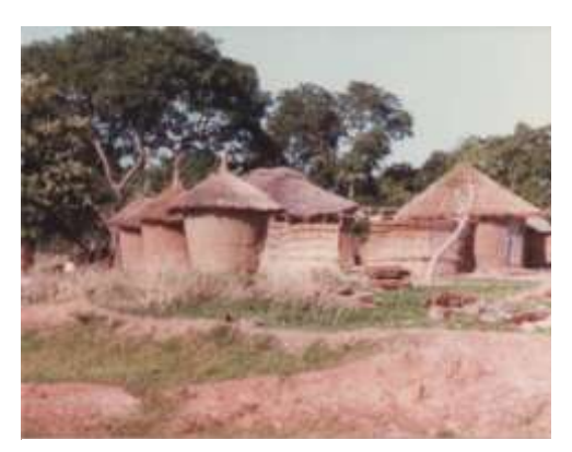
Nigerian Village Compound