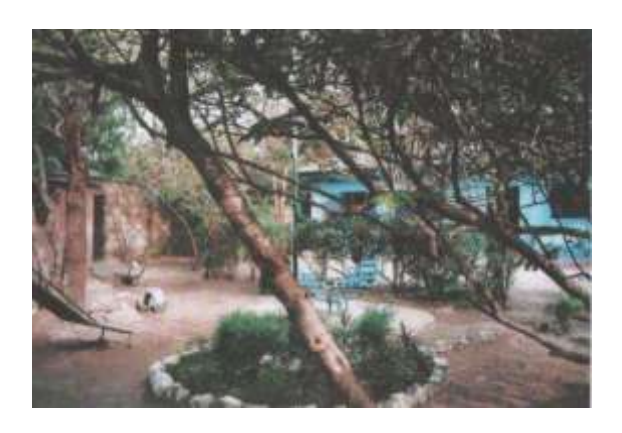
The grounds around St. Peter's Primary School

St. Peter's is a school of mixed faiths, with a population of 290 pupils. Pupils in their bluepink uniforms arrive in school at 7.30a.m. each day. Their first activity is to care for the environment, which is to take part in the broom-brushing of the leaves and papers in the compound.