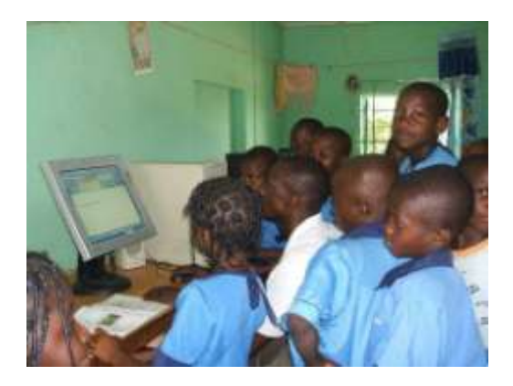
St. Peter's pupils attentive to the computer lesson

In the village school in Maikunkele there is a wonderful sense of Community with parents, guardians, pupils and teachers all working together for the good of their children. The P.T.A and Board of Management are very supportive and the school has developed in many areas over the years. There is now a computer room and it is hoped to finish a science room.